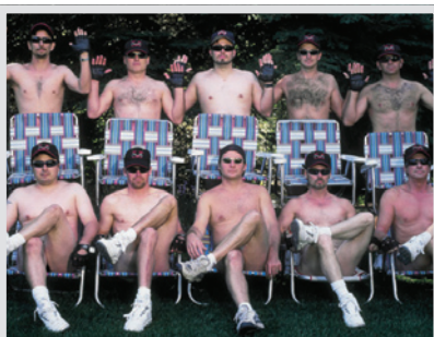
Vail Precision Lawn Chair Demonstration Team