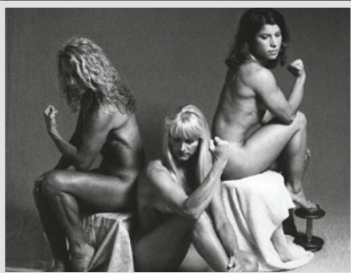
Aria Spa & Club Instructors