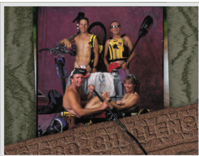
Eco Challenge Team Vail