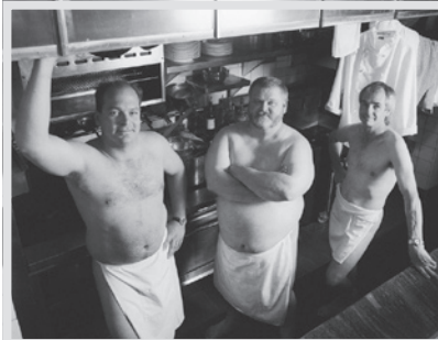
Beaver Creek Chefs