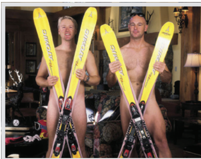
Powder 8 Synchronized Ski Team