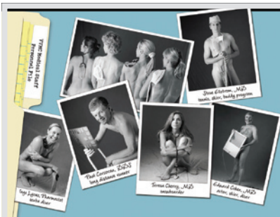
Vail Valley Medical Center Staff