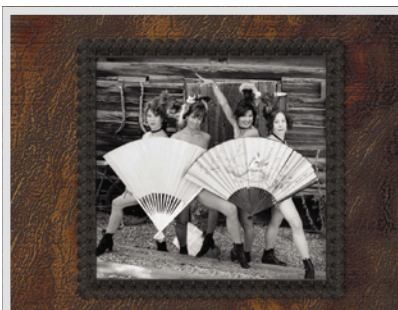
Buffalo Moon Saloon Revue